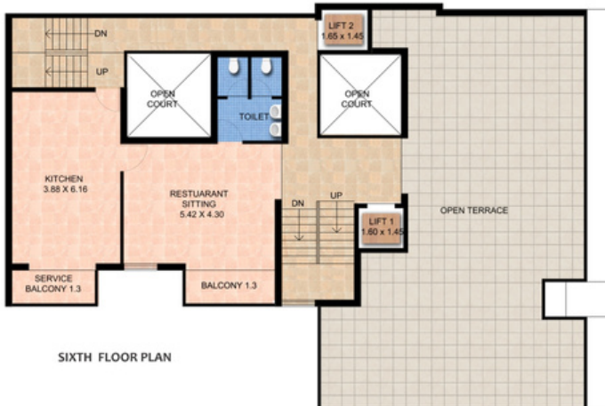
SIXTH FLOOR PLAN

True to the reputation of Dyna Developers, "DYNA ENCLAVE PHASE I" Commercial/residential project offering the best in construction, quality and Architectural excellence. It is 22 years of trust, quality, commitment and dedication.