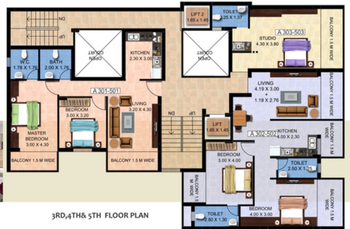
3RD, 4TH & 5TH FLOOR PLAN