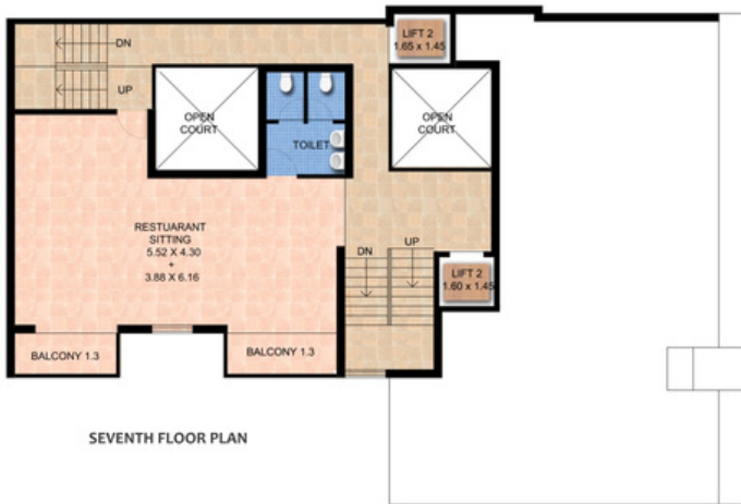
SEVENTH FLOOR PLAN