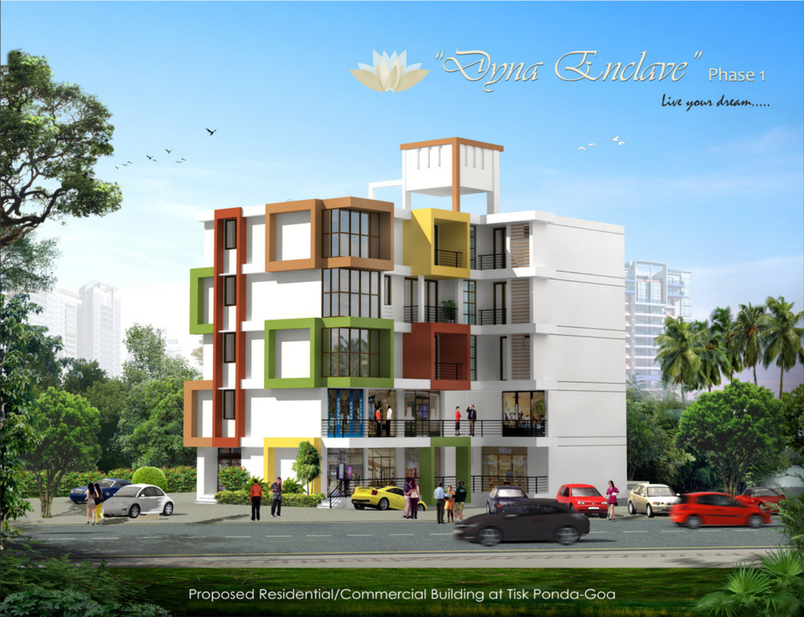
Proposed Residential/Commercial Building at Tisk Ponda-Goa